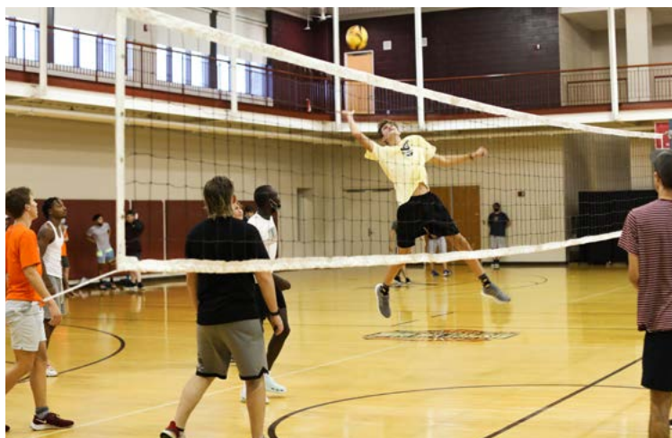
Access to facilities and university services is included in student fees.

Squires Student Life Center is also a staple of student life, with billiards, bowling, table tennis, and other activities.