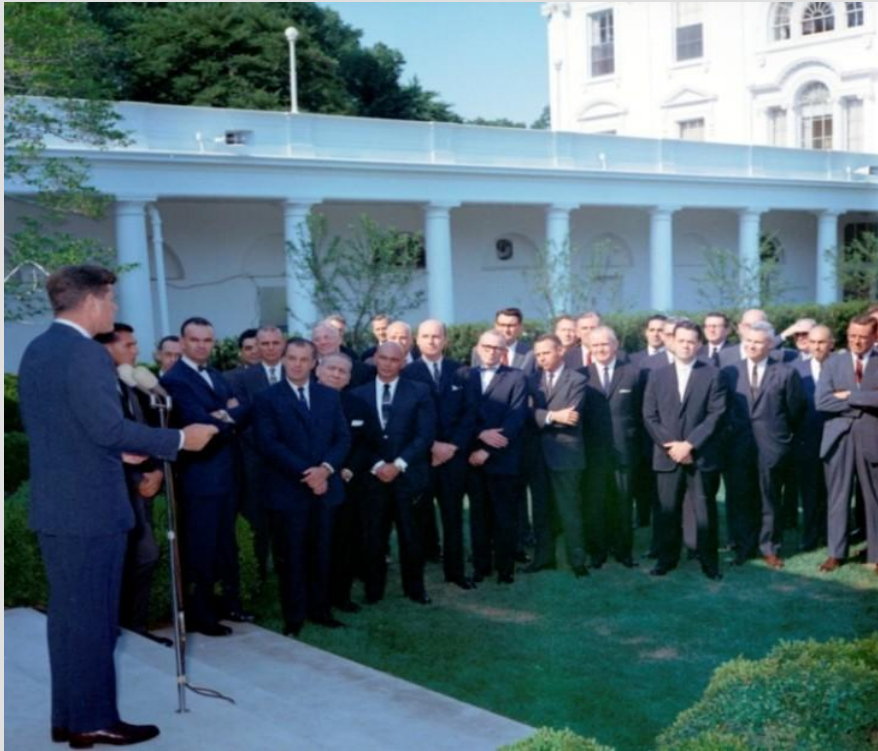
USAID was founded in 1961 by President Kennedy

"There is no escaping our obligations: our moral obligations as a wise leader and good neighbor in the interdependent community of free nations — our economic obligations as the wealthiest people in a world of largely poor people, as a nation no longer dependent upon the loans from abroad that once helped us develop our own economy — and our political obligations as the single largest counter to the adversaries of freedom." — John F. Kennedy